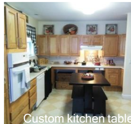
Custom kitchen table