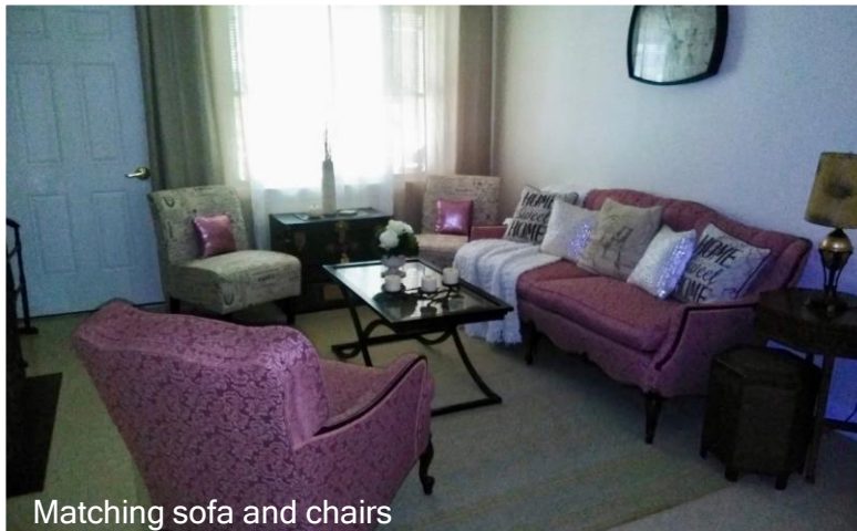
Matching sofa and chairs

Photos from client homes, furnished by New Life: