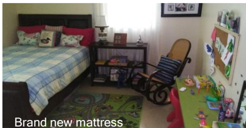
Brand new mattress